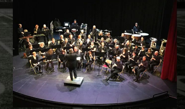
Winter Concert (jan)